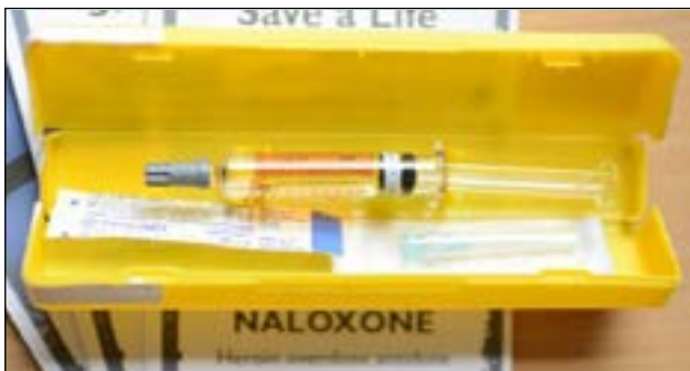
Leaflet produced by the Pavilions Health Promotion Team